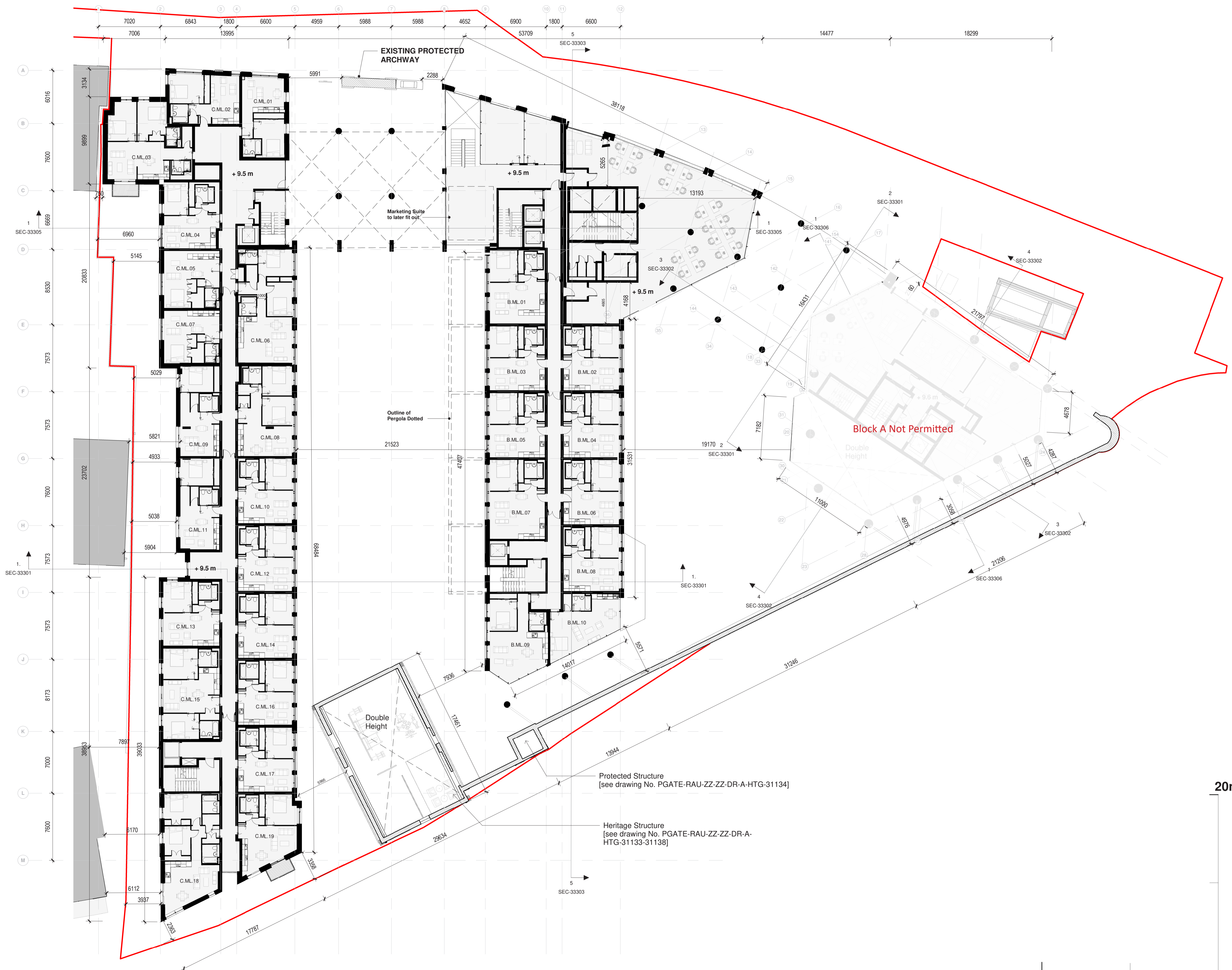
Proposed Mezzanine Floor Plan 1 : 200

Notes: DO NOT SCALE FROM THIS DRAWING. USE FIGURED DIMENSIONS IN ALL CASES. VERIFY DIMENSIONS ON SITE AND REPORT ANY DISCREPANCIES TO THE ARCHITECTS IMMEDIATELY. THIS DRAWING TO BE READ IN CONJUNCTION WITH THE ARCHITECTS SPECIFICATION. © THIS DRAWING IS COPYRIGHT AND MAY ONLY BE REPRODUCED WITH THE ARCHITECTS PERMISSION. OSI License Number - AR 052219 Projection / Spatial Reference: Projection: IRENET196_ish_Transverse_Mercator Centre Point Coordinates: X,Y= 713657.3699,734403.2446 Reference Index: Map Series / Map Sheets 1:1,000 | 3263-02 1:1,000 | 3263-08 1:1,000 | 3263-07 1:1,000 | 3263-03 Vertical Datum: MALIN HEAD